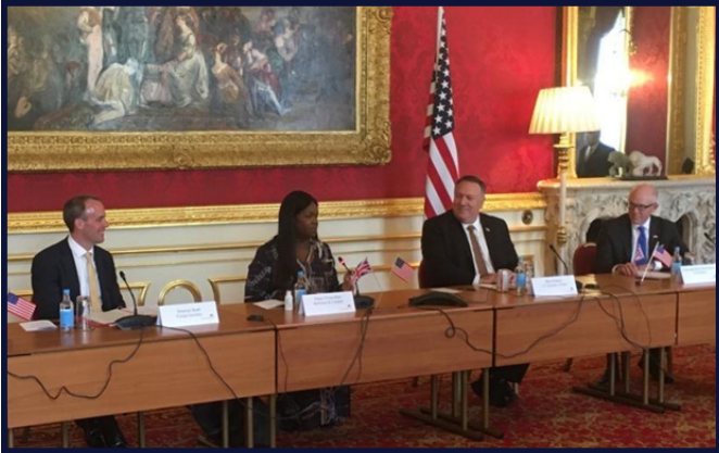
Roundtable with US Secretary of State Mike Pompeo and UK Secretary of State for Foreign and Commonwealth Affairs The Rt Hon Dominic Raab MP