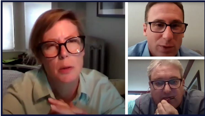
Infrastructure Investment: Paving the Way Towards Economic Recovery Sponsored By: Turner & Townsend