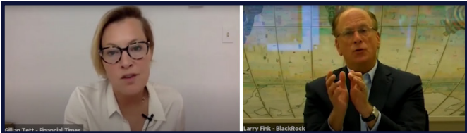
Transatlantic Finance Forum: A Conversation with Larry Fink, Chairman and Chief Executive Officer, BlackRock and Gillan Tett, Chair of Editorial Board and Editor-At-Large, US, Financial Times

Sponsored by: ACCA, Broadridge, Chicago Booth School of Business, EY, Marsh, Tata Consultancy Services, Vodafone Business