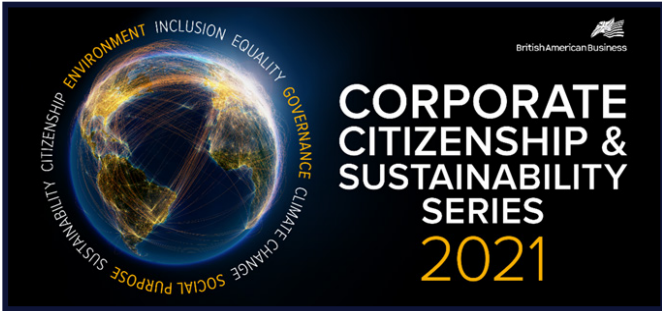
Corporate Citizenship & Sustainability Series Launch A New ESG Era: Impacts & Trends 2021

Sponsored By: ACCA, Ascot Group, Debevoise & Plimpton, EY, Fitch Ratings, Letter One, Willis Towers Watson