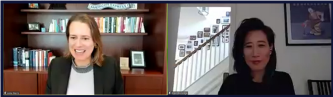
The STIR Panel for International Women’s Day: From Resilience to Power: Women’s Leadership to Forge a Gender Equal World in a Time of Disruption

Sponsored by: ACCA, Broadridge, Chicago Booth School of Business, EY, Marsh, Tata Consultancy Services, Vodafone Business